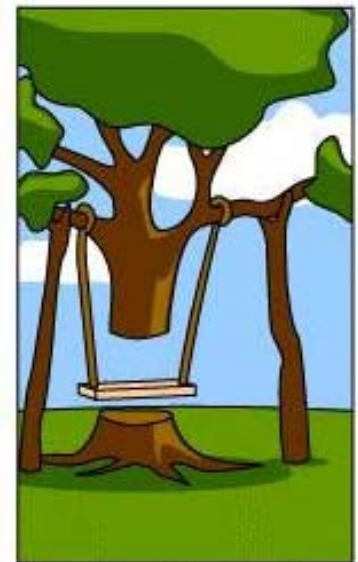
How the Analyst designed it