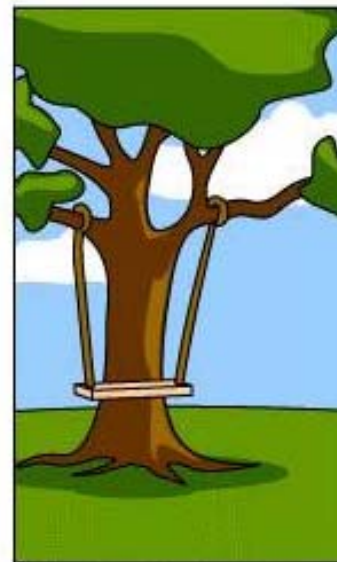
How the Project Leader understood it