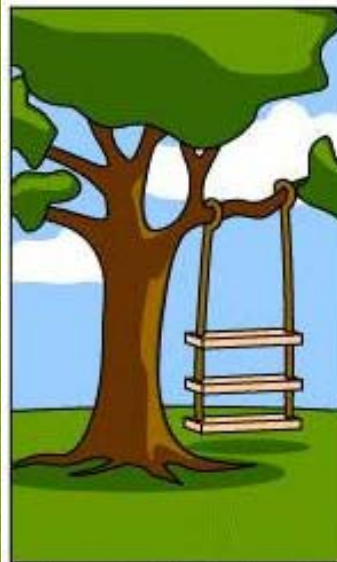
How the customer explained it