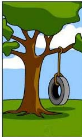
What the customer really needed