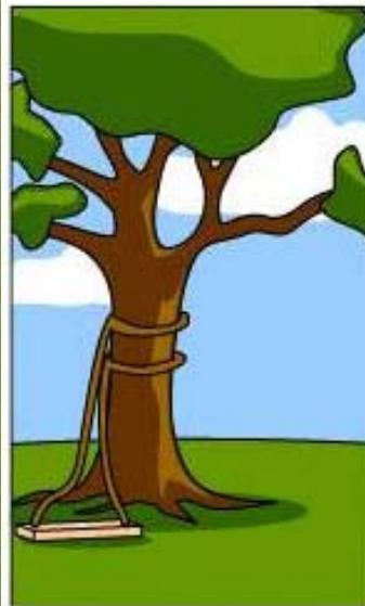
How the Programmer wrote it