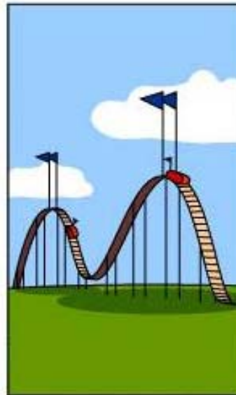
How the customer was billed