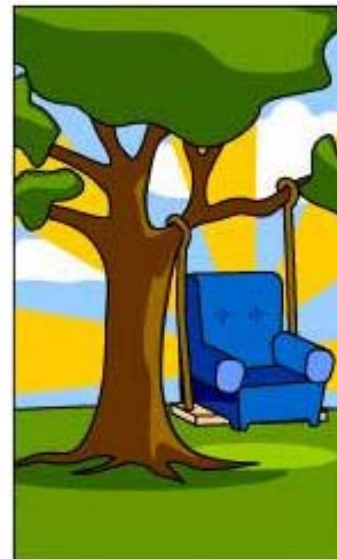
How the Business Consultant described it