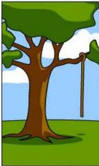
What operations installed